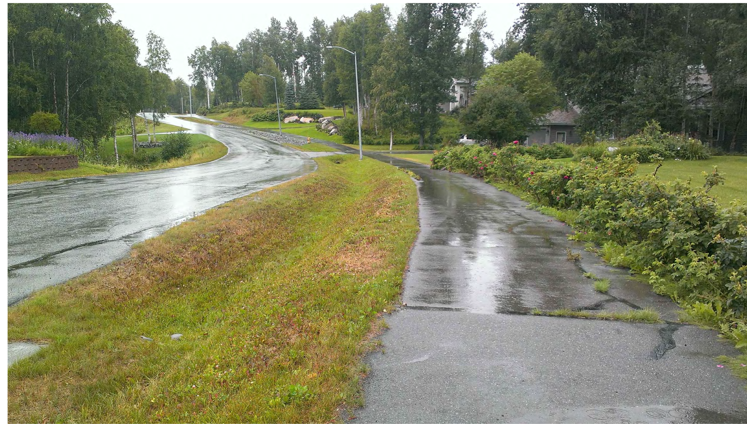
CONTINUOUS LIGHTING / EXISTING PATHWAYS