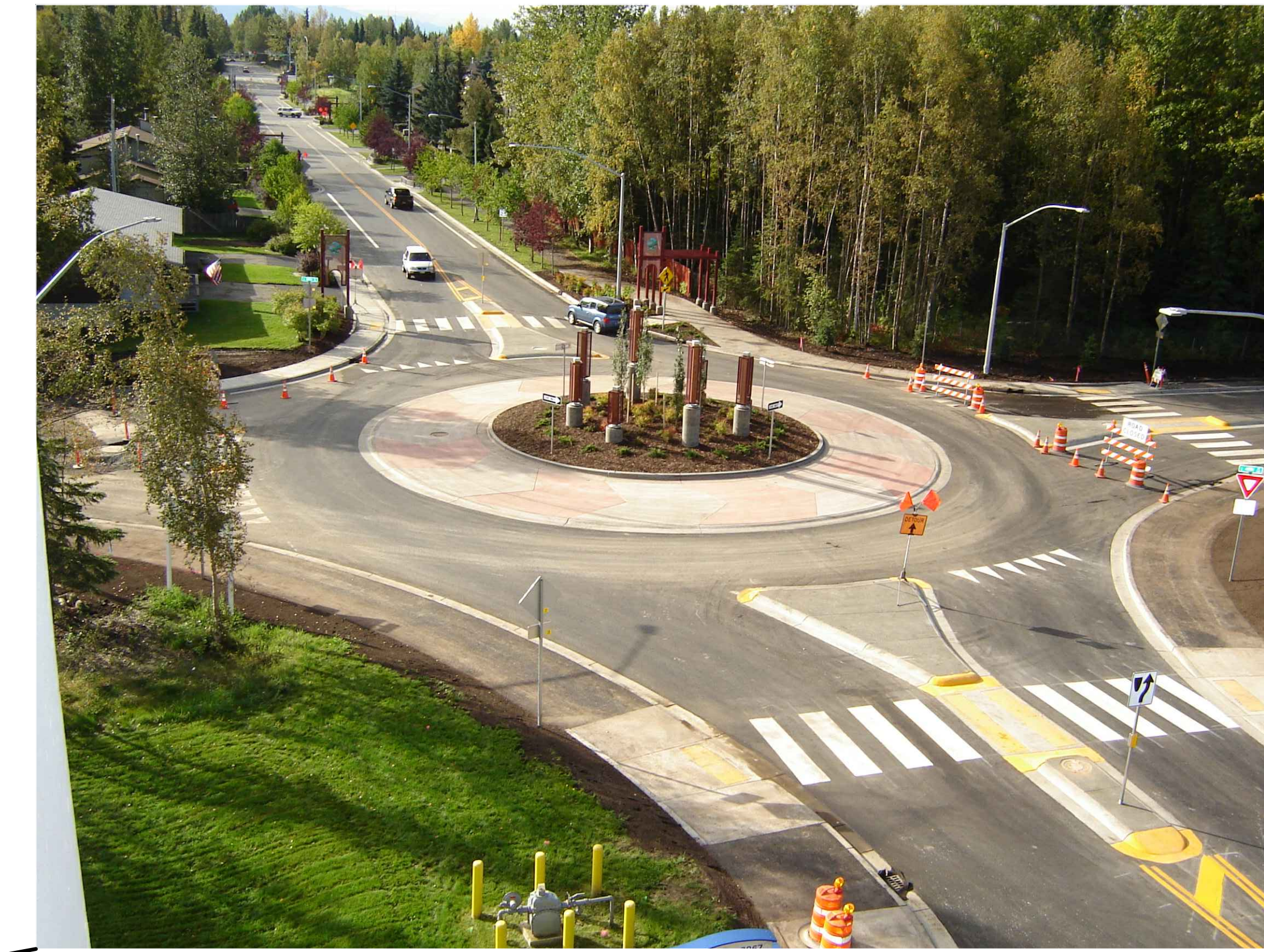
E 40TH AVE / PIPER ST