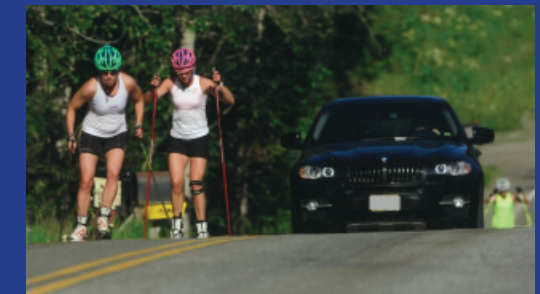
NEED FOR MULTI-USE TRAIL (WALKING, RUNNING, BICYCLING, SKIING)