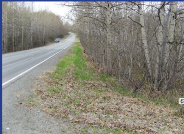
MAINTAIN "SCENIC & AESTHETIC CHARACTER" OF ROAD & NEIGHBORHOOD