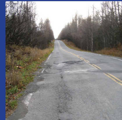
SUBSTANDARD ROAD FOUNDATION & SURFACE