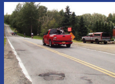
ACCOMMODATE INCREASING VEHICLE TRAFFIC TO KINCAID PARK