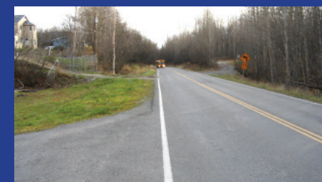
LACK OF SAFE BUS STOP AREAS FOR ELEMENTARY, MIDDLE & HIGH SCHOOL STUDENTS