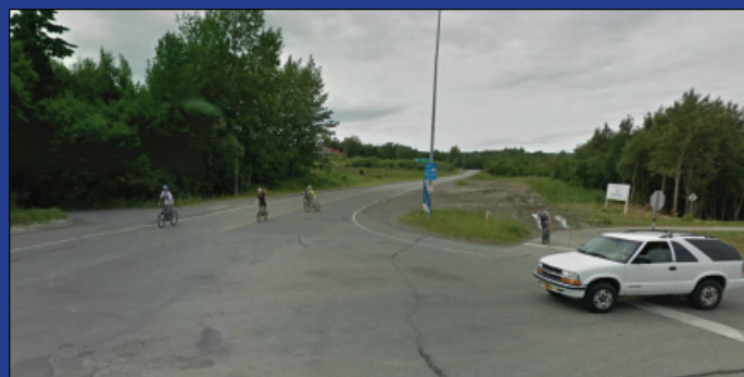
NEED SAFE PEDESTRIAN CROSSING