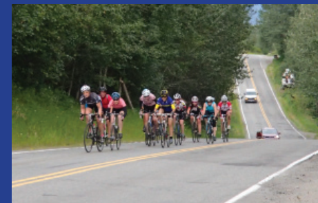
ACCOMMODATE INCREASING ADULT TRAINING/RACING USE OF VEHICLE TRAVEL LANES