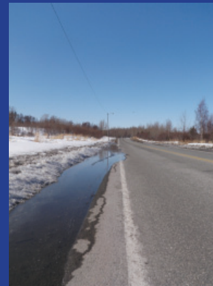
STORM WATER RUNOFF