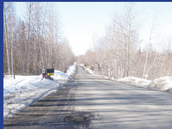
NEED ROOM FOR SNOW STORAGE & MAINTENANCE