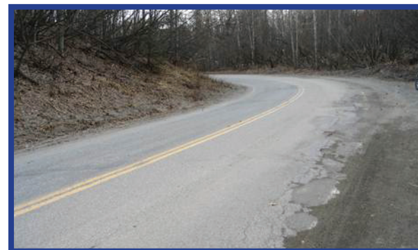
LACK OF LIGHTING, LANDSCAPING, PAVED SHOULDERS & POOR SIGHT DISTANCES